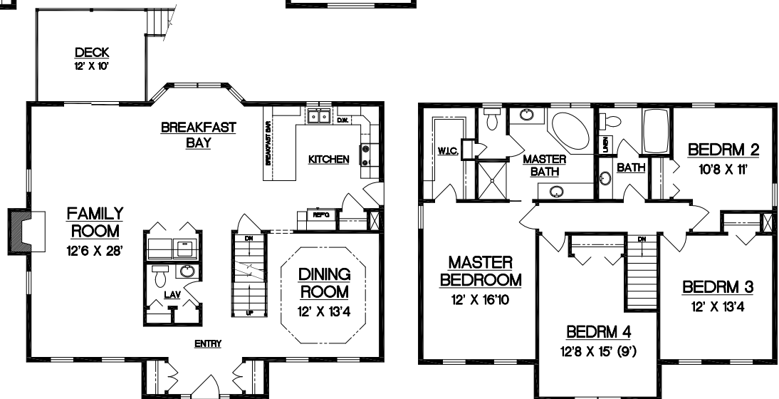
Four Bedroom Option